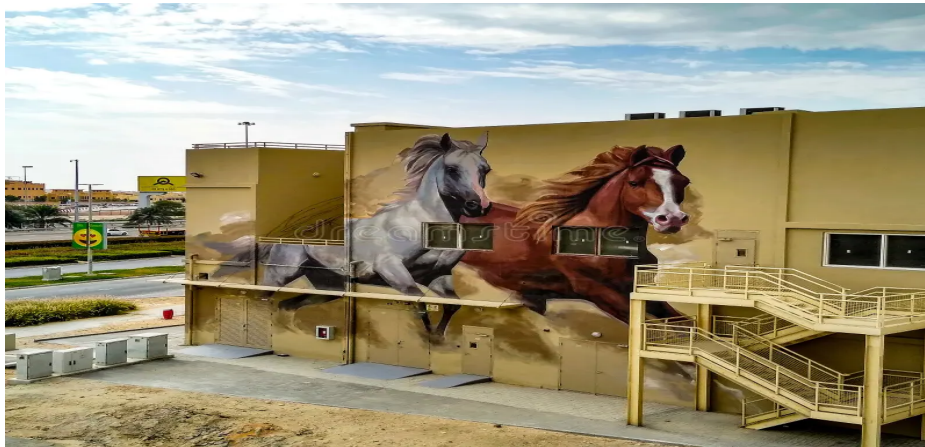
Street art in Abu Dhabi in the UAE